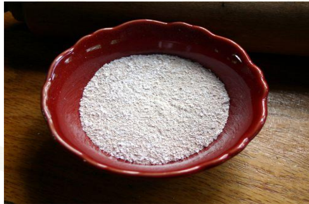
Figure 1: Egg Shell Powder